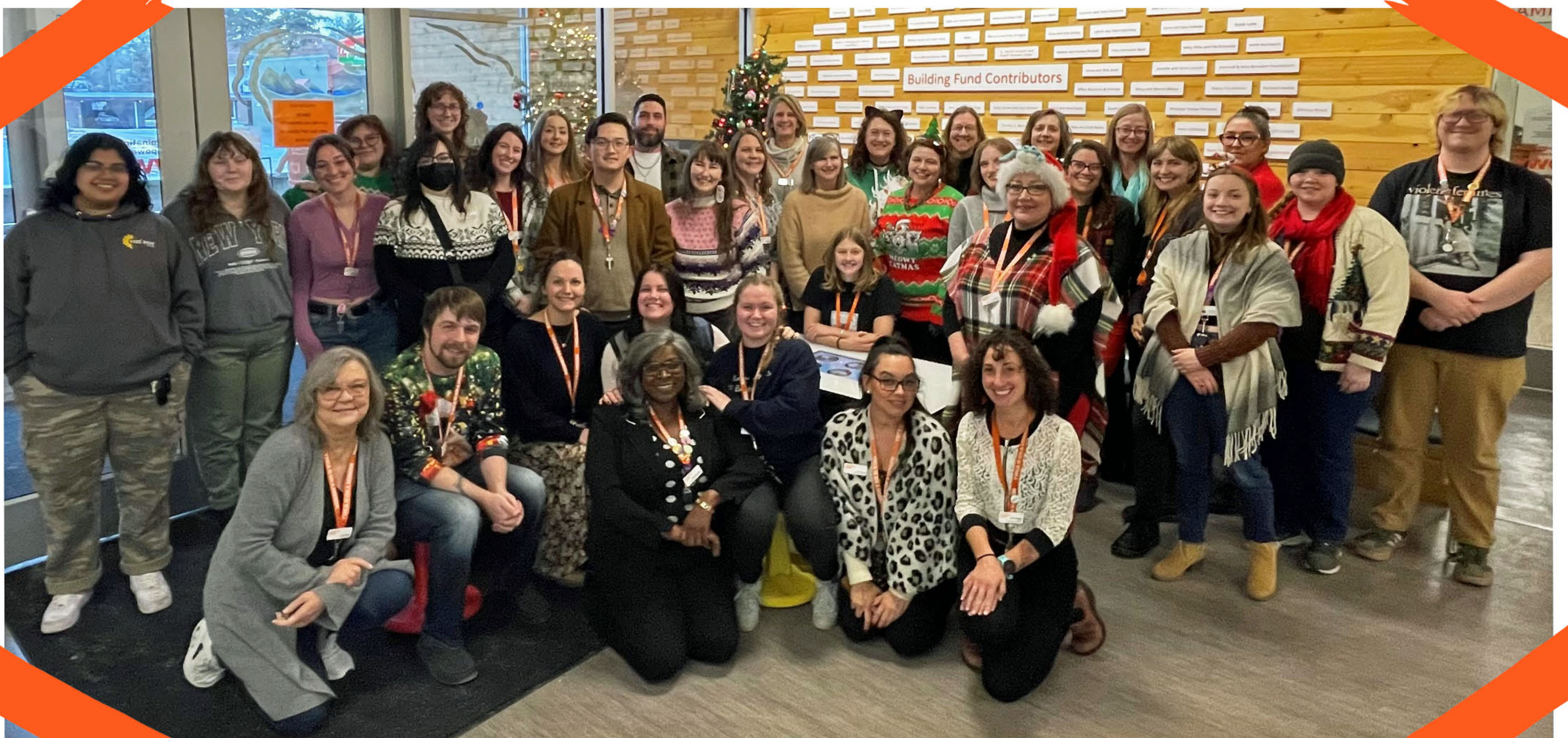
YWCA Missoula staff members, December 2024